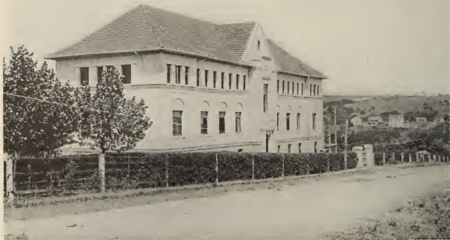
SOUTHERN CROSS SCHOOL, PORTO ALEGRE

were made, good people gave, the lot was bought, the school building was begun in October, 1915, and was ready for occupancy in April, 1916, when school was opened in it.